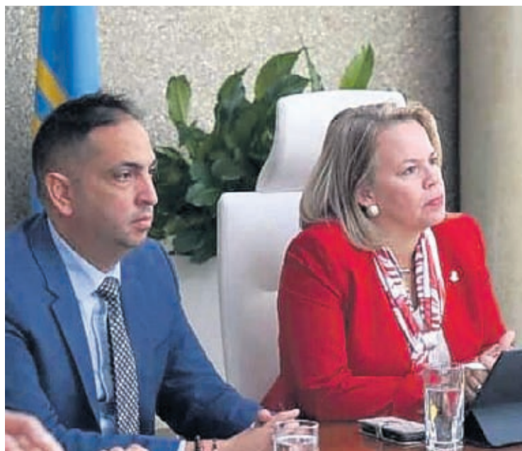
ORANJESTAD - Prome Minister, Evelyn Wever-Croes a anuncia cu entrante ayera nan a intro-

duci un task force pa controla durante e shelter in place.